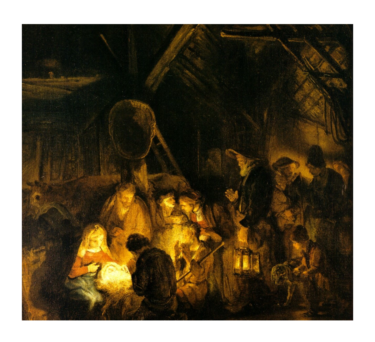
Lessons & Carols Christmas Eve Service December 24, 2017