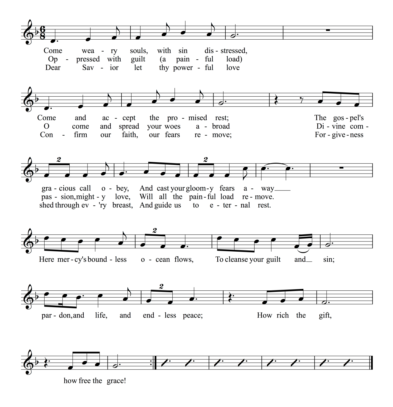
Prayer of Adoration